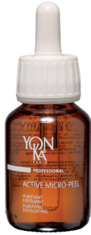
P. 60 ml